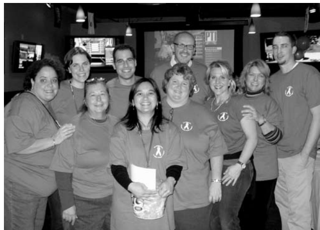
Members of the Potomac Area ONS Chapter raised more than $3,400 during a fundraising event to benefit the ONS Foundation.

"This fundraiser is a model for other chapters to use in creating a community event to support changing the lives of patients with cancer and their families," Sowers wrote in an e-mail after the event. "They should be proud of the event they worked together to create."