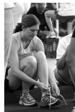
A participant prepares for the 2007 Fun Run, Walk, and Wheel in Las Vegas, NV.

For information about the Fun Run and new Fun Run activities, visit www.onsfoundation.org . For on-site Fun Run registration, visit the Pfizer Oncology Booth in the Exhibit Hall before the race.