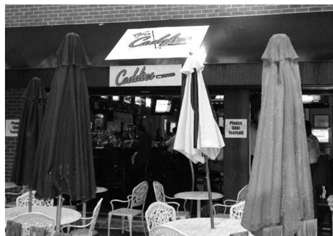
Caddies on Cordell generously hosted the PAON chapter fundraiser and even donated a portion of the proceeds to the chapter as a gift to the ONS Foundation.

Thank you, Caddies on Cordell and PAON chapter, for your hard work to benefit the ONS Foundation.